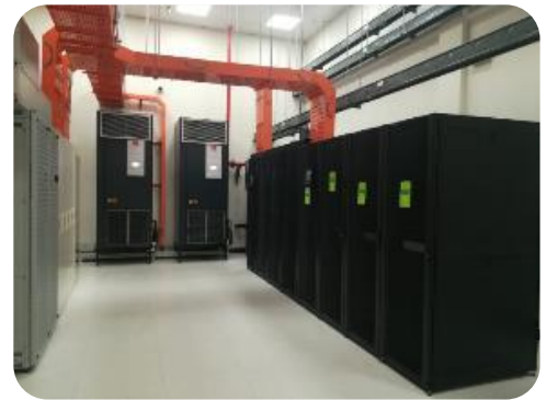
Double conversion 99% efficient N+N Solution