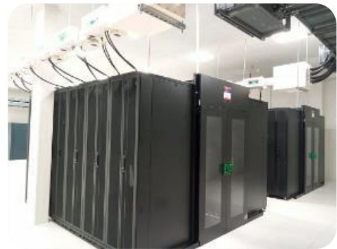
Hot & cold containment solution