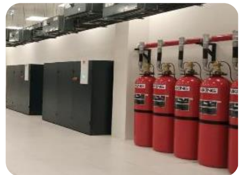
Highly vigilant VESDA & fire suppression system