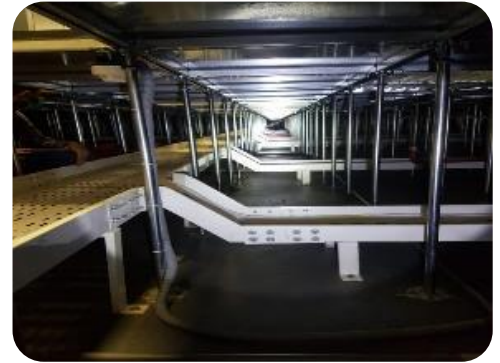
Dedicated power & data routing paths