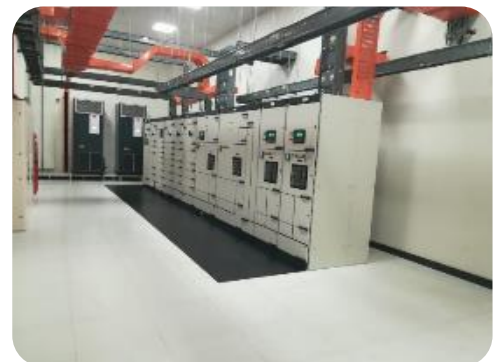
Type tested switchgear system