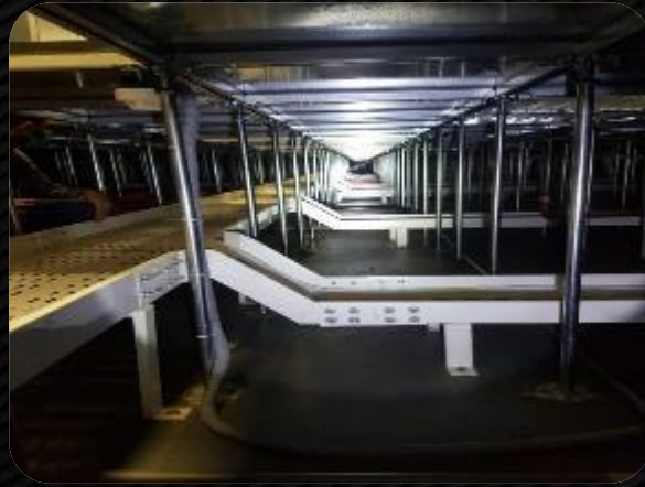
Dedicated Power and Data routing Paths