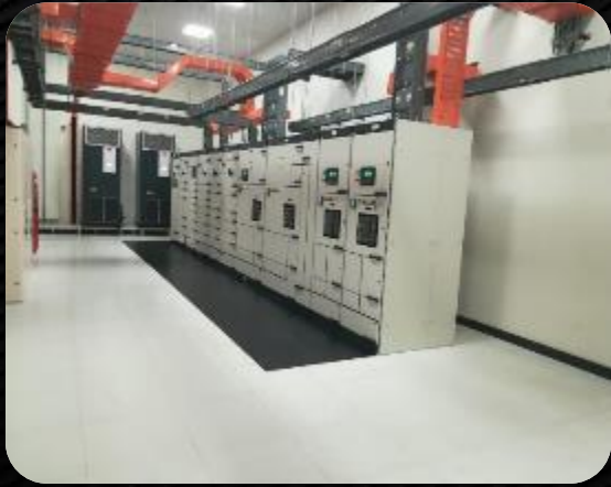
Type Tested Switchgear Systems