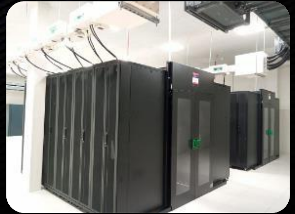
Hot & Cold Containment Solution