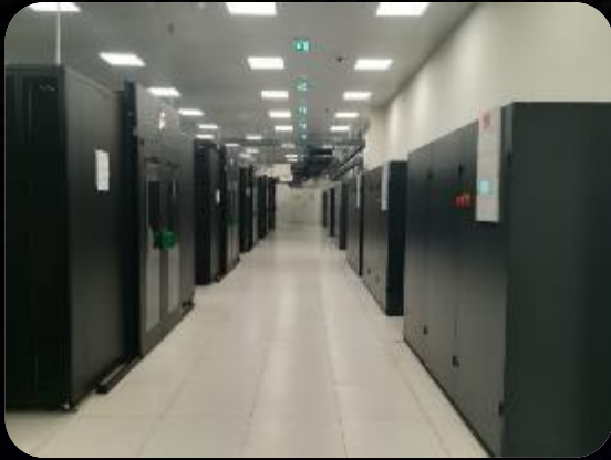
Perimeter and In Row Cooling for Data Hall