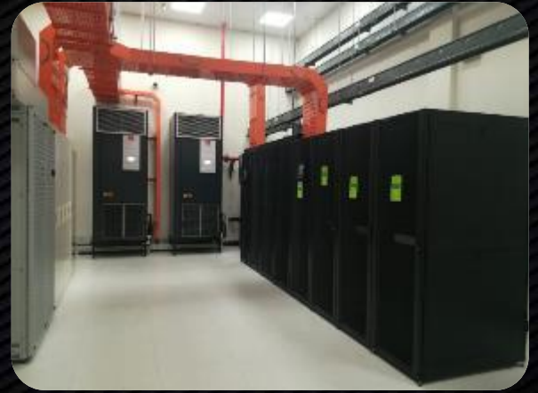
Double Conversion 99% Efficient N+N Solution