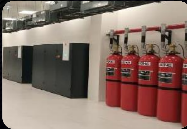
Highly Vigilant VESDA and Fire Suppression System