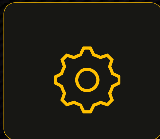
Centralized Integration & Mgmt.