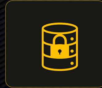
Data Loss Prevention (DLP)