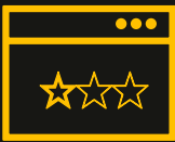
Application Tracking & Rating