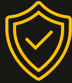
Auto Threat Defusal